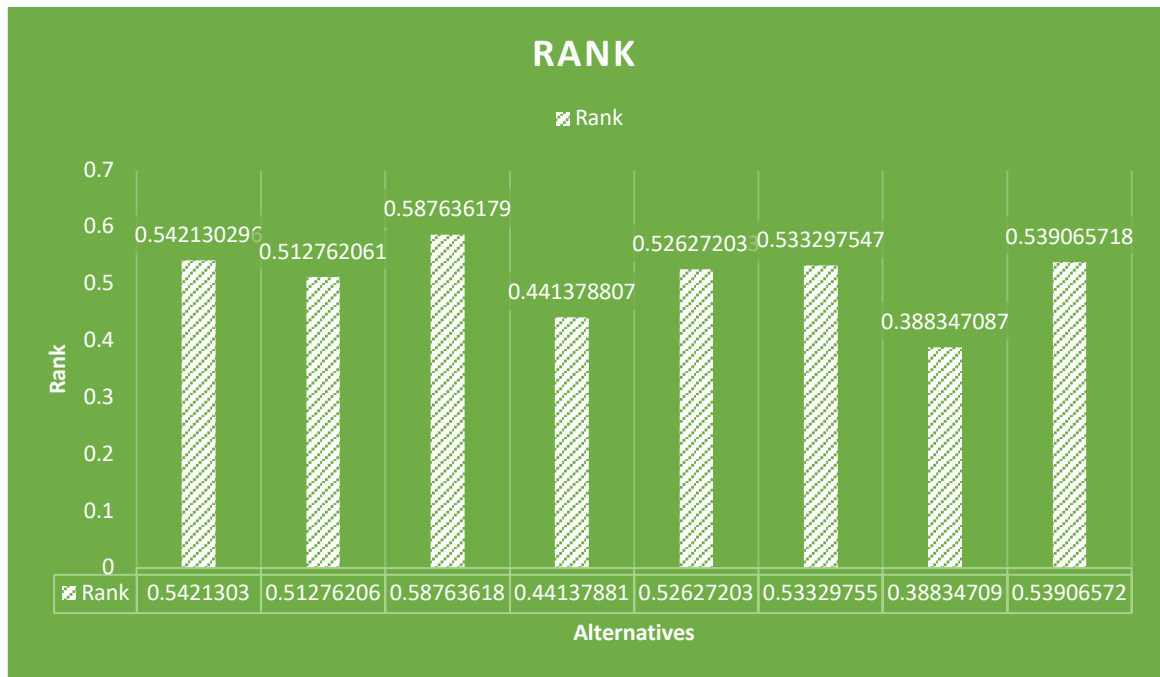
Figure 3. The rank of alternatives by the TOPSIS method.