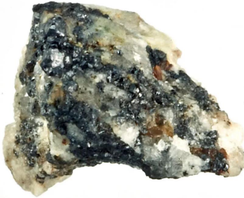
Figure 2: Light image of entire MSNF specimen prior to sampling, Khatyrka CV3 meteorite.[11]

Moreover, some papers argue that such a rock may be of manmade origin, as Bindi et al noted: