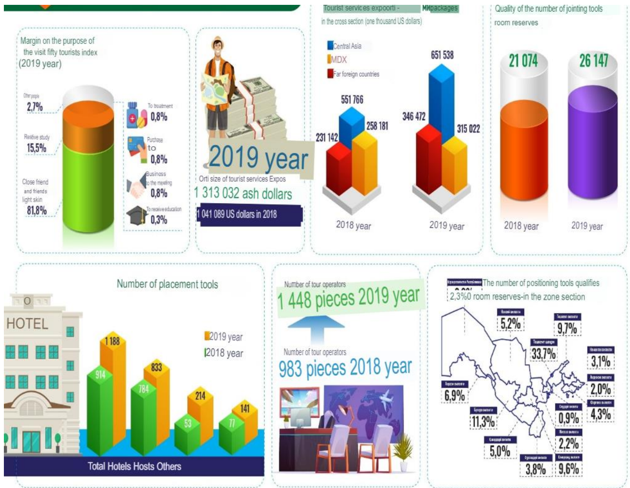
Figure 2: Dynamics of indicators of pre-pandemic and pandemic tourism in Uzbekistan.

According to forecasts and targets for the development of tourism in the Republic of Uzbekistan, this year the volume of tourism revenues decreased to $ 1.53 billion, when the pandemic was ignored. That is how it should have been. This means that the direct damage caused to this industry by the pandemic amounts to $ 1.3 billion, when calculating the addition with a multiplicative effect - about $ 3.5 billion. The tour operator also proposed to coordinate with the creation of a joint group that expresses a quick attitude to colleagues in the territory, the development of new mixed species on another topic: gastronomic species, vitamin species, nomadic species, motorists, pilaf species, archaeological and other species that pass through our tourist cities and centers, it is important to develop effectively. Tour operators need a lot of information to do their job. Nevertheless, the information they need is often lost, comes too late, and may be unreliable or completely inaccurate.