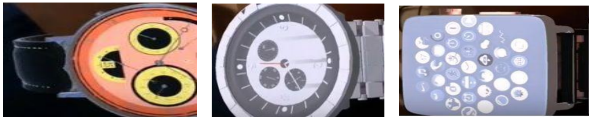
Figure 4: Watch Models

For designing 3d models, there is a lot of software available. Fig 4 shows three basic watch models, which we've designed using blender and Maya to demonstrate the concept.[3]