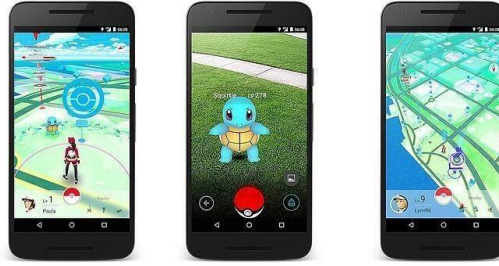
Figure 1: Pokémon Go screenshot

Real Strike: This game offers a real shooting environment virtually that gives users a real shooting experience. A marker is to be scanned by the user through phones and find out the target. It also offers night vision and thermal goggles to fight in the level of extreme conditions and complete missions in the evening.