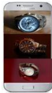
Figure 3: E-catalogue

E-catalogue will contain 3d models of the Watch. Fig 3 shows a sample E-catalogue through which users can choose watches.