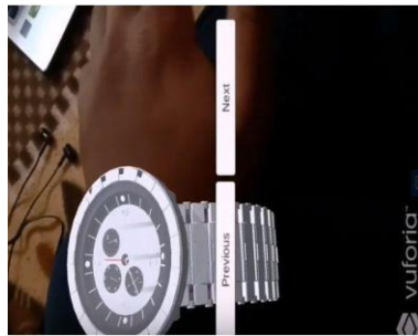
Figure 5: Prototype Screen

We’ve projected a 3d object(i.e., Watch) on a flat surface(i.e., a band). Whenever an app encounters a band, then it will project Watch on it. UI is designed using C#. As of now, we’ve given two buttons (Next and Previous) in our app. These buttons are used to select the watch model. Fig 5 shows a basic version of our app.